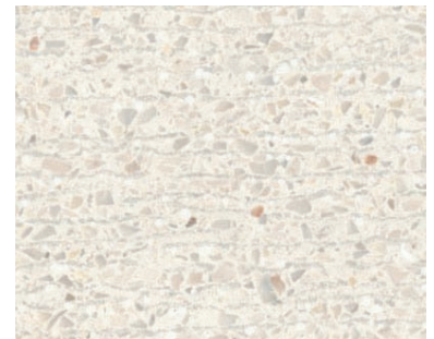
white (Cserhát C/D4)