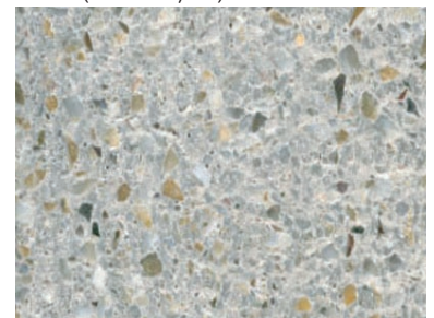
grey (Duna C/D4)