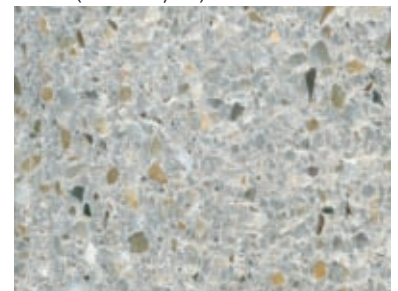
grey (Duna C/D4)